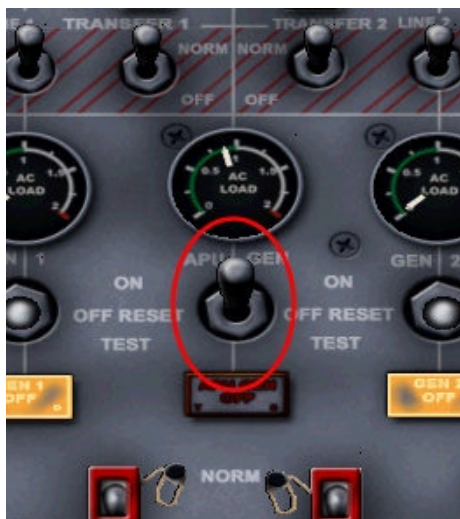
Figure 8: Connect the APU generator