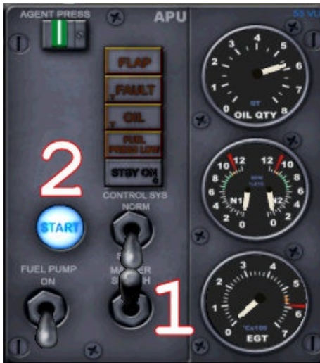
Figure 7: APU start sequence