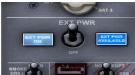
Figure 5: External power switch