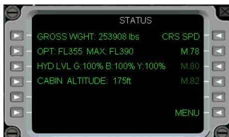
Figure 14: Set-up panel „Status“ page

The “Status” page of the set-up panel shows the optimum and maximum cruising level for the current gross weight and selected Mach cruising speed.