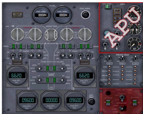
Figure 6: APU section on fuel panel